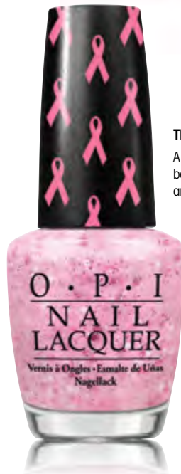
The Power of Pink A sheer pink base beautifully suspends light and dark pink confetti.

For more information about OPI Pink of Hearts, contact your Authorized OPI Distributor. CONSUMER ACTION WILL NOT RESULT IN ADDITIONAL DONATION.