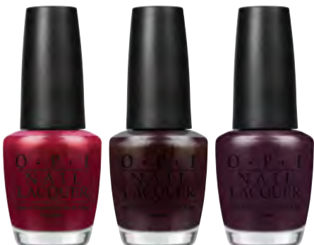
Red Fingers & Mistletoes

This smooch-worthy red shimmer is holiday-perfect.